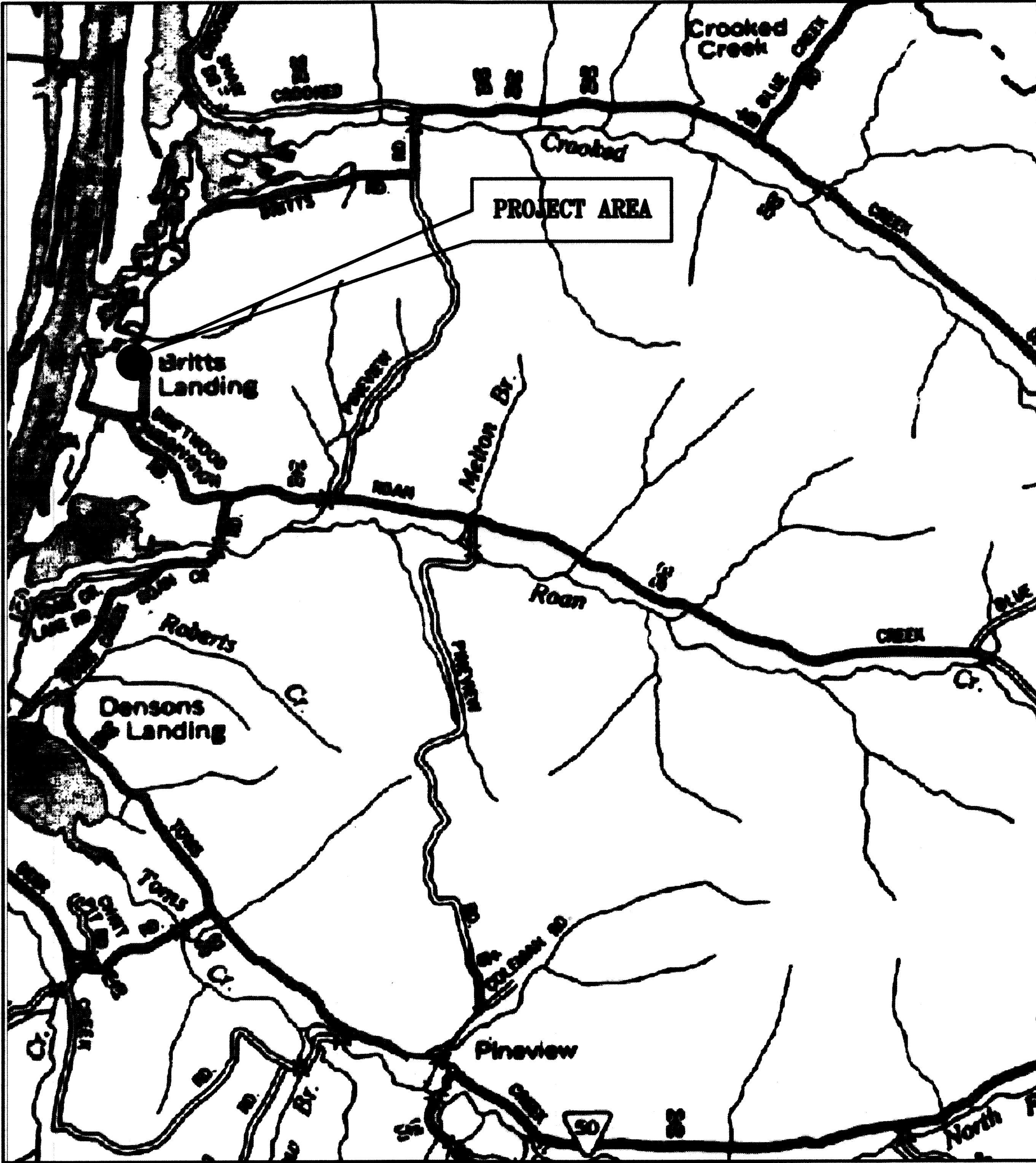
VACINITY MAP NOT TO SCALE