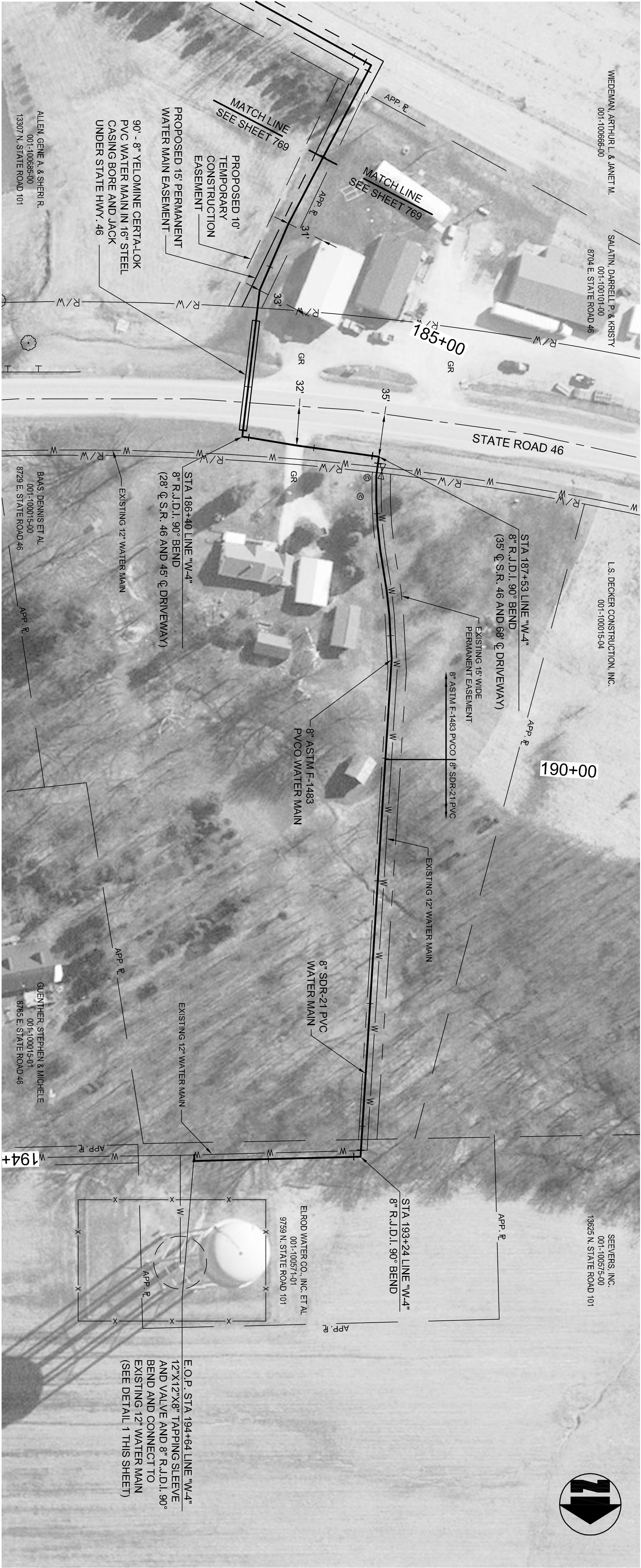
PLAN VIEW - STA. 184+00 TO E.O.P. STA. 197+64 LINE "W-4"