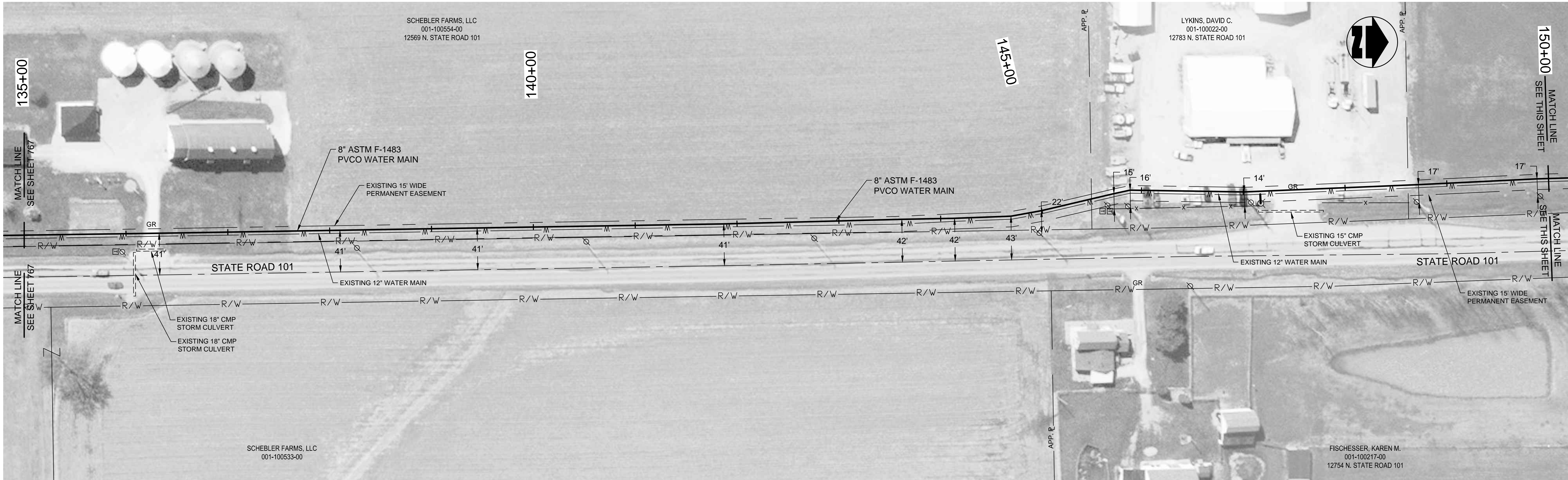
PLAN VIEW - STA. 135+00 TO STA. 150+00 LINE "W-4"