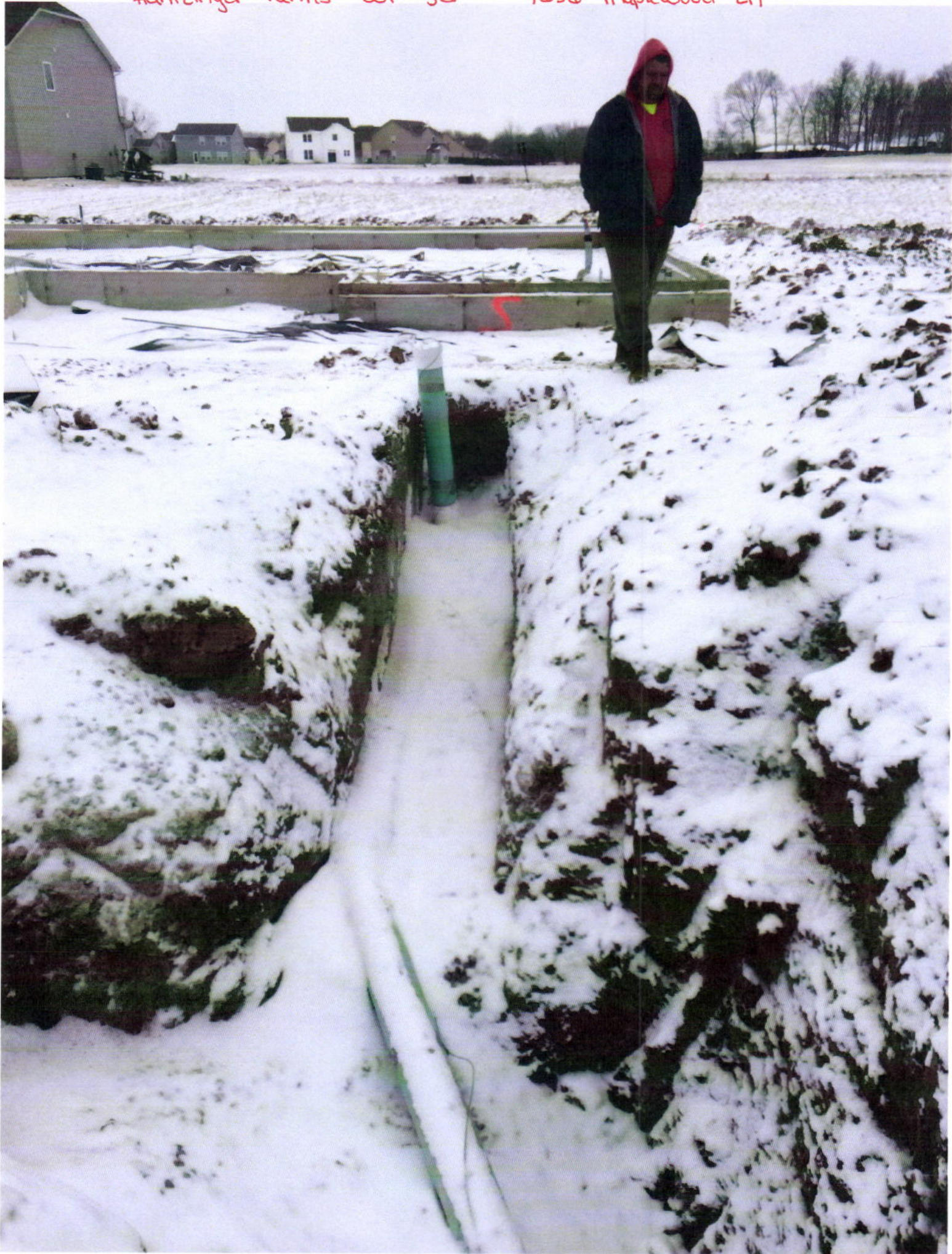
Huntzinger Farms Lot 56 1656 Maplewood Ln