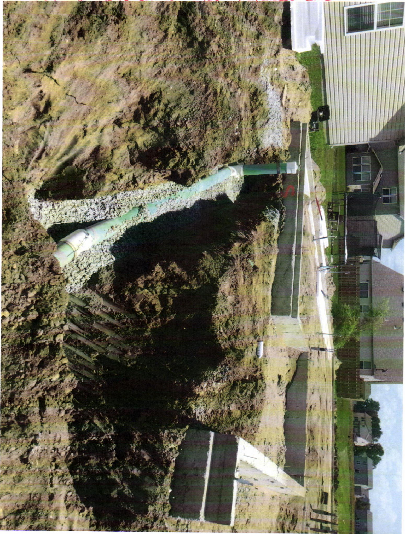
11405 Maplewood Lane