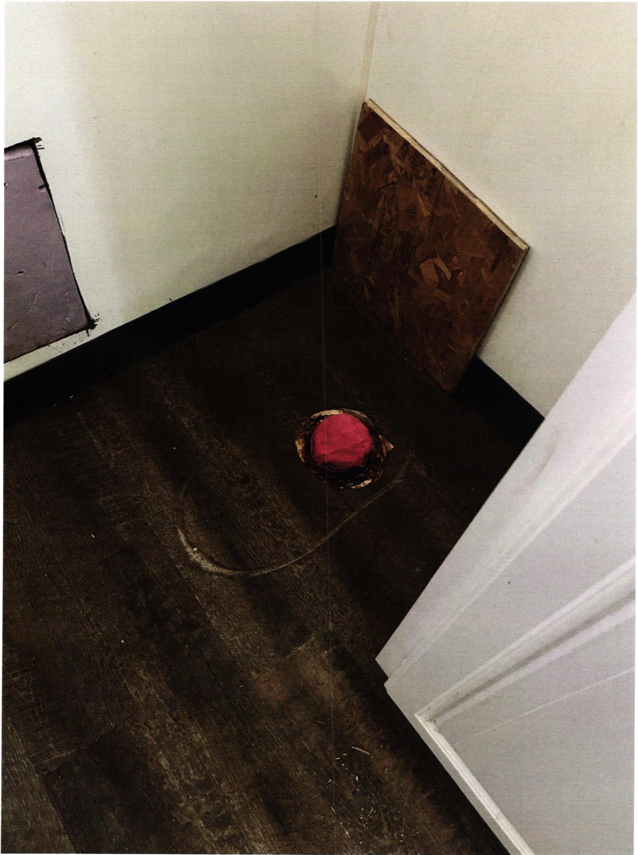
Connection never made to sewer – removed toilet in barn so they would not need to connect the barn